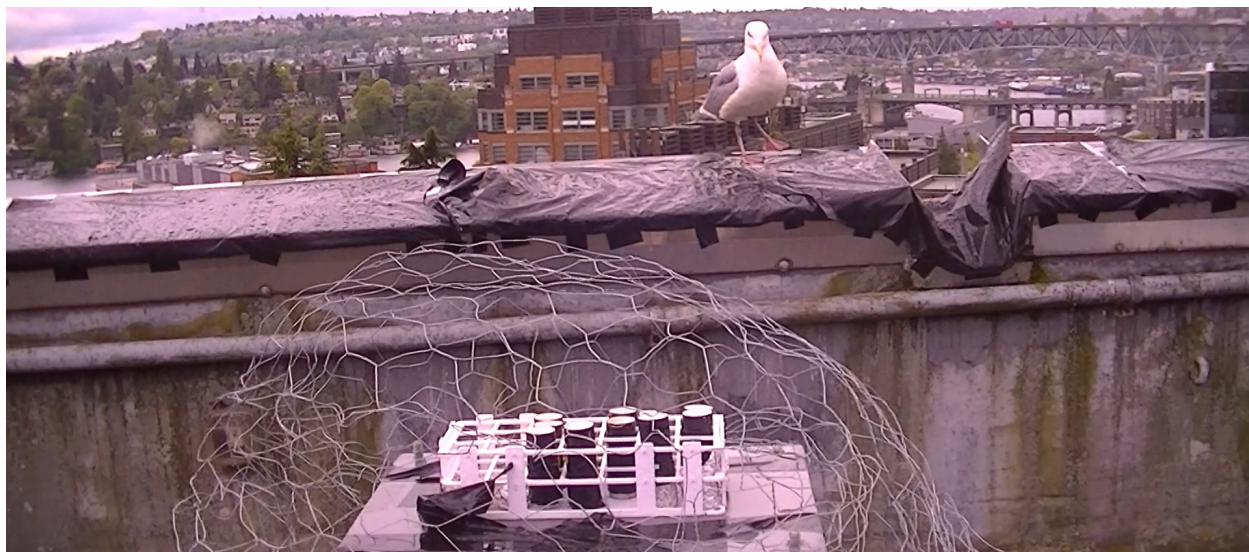
Controlled exposure experiment of Lane Mountain samples in progress on the roof of the Atmospheric Sciences and Geophysics Building, University of Washington, Seattle. Cores were exposed for 1 million seconds to natural sunlight in August 2021, matching roughly the annual daytime irradiance and solar path for the Lane Mountain Quarry site in Addy, Washington.