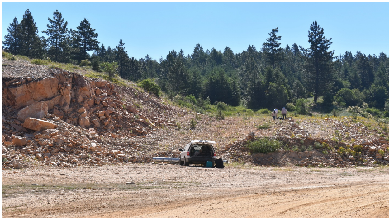
Lane Mountain Quarry, Washington state. Trial site for controlled exposure experiment and OSL scanning study for OSL exposure dating. Site hosts 11-year exposed quartzite surfaces. June 30, 2021.